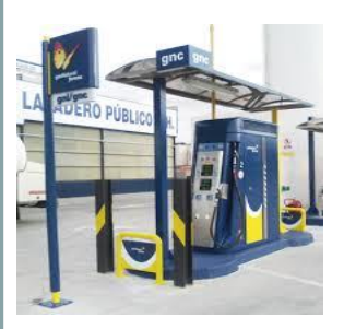
NaturalG as Station