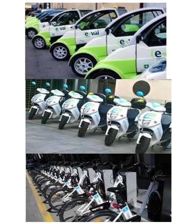
Car / moto / bici sharing